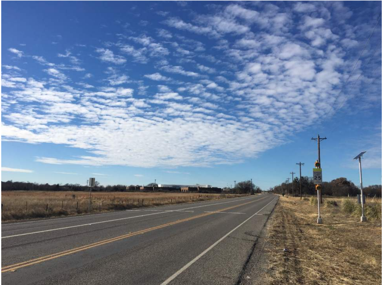
FM 1189 School zone at Brock ISD

County has been working with multiple school districts to develop traffic control plans and assist with coordinating road projects that will align with their future development plans. Last summer Brock ISD constructed a new elementary school on FM 1189. The previous school zone was only at the intersection of Grindstone and did not extend to the new school. The County worked with TxDOT to create a second school zone that encompassed both the high school and new elementary. We also reduced the posted speed from 50 mph to 40 mph. This together creates a much safer environment. The final step is a new signal planned for the entrance to the Eagle Spirit Lane that is in the final design/review stages.