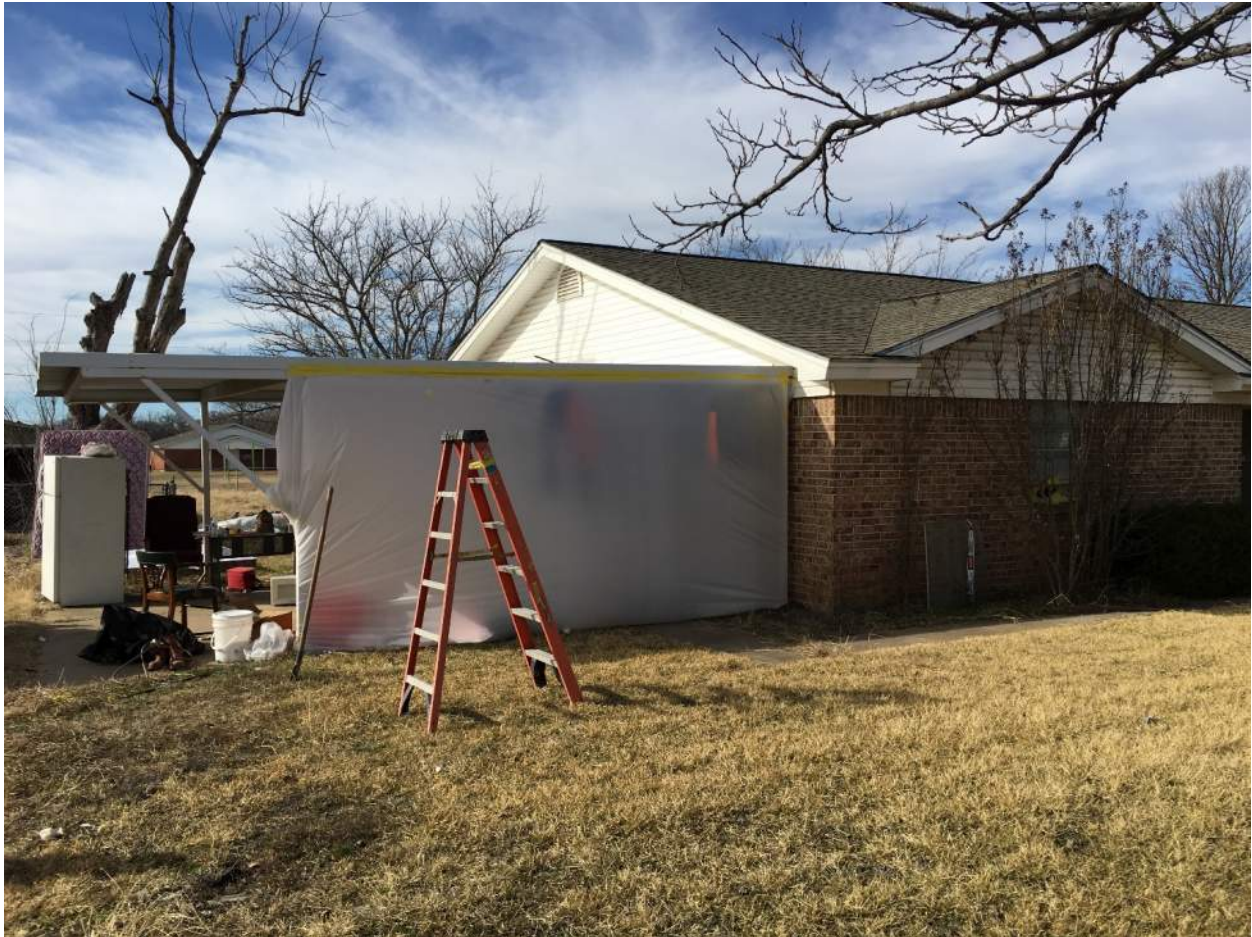
Eastloop Phase 1 - demolition process ongoing

Asbestos removal and demolition of structures within Eastloop Phase 1 has commenced. Contractor has posted proper notifications and air containment to complete the project within guidelines of Texas Health and Safety Code. Their initial effort is to remove all items that remained in the house, then focus on the asbestos removal, and finally demolish the remaining structure.