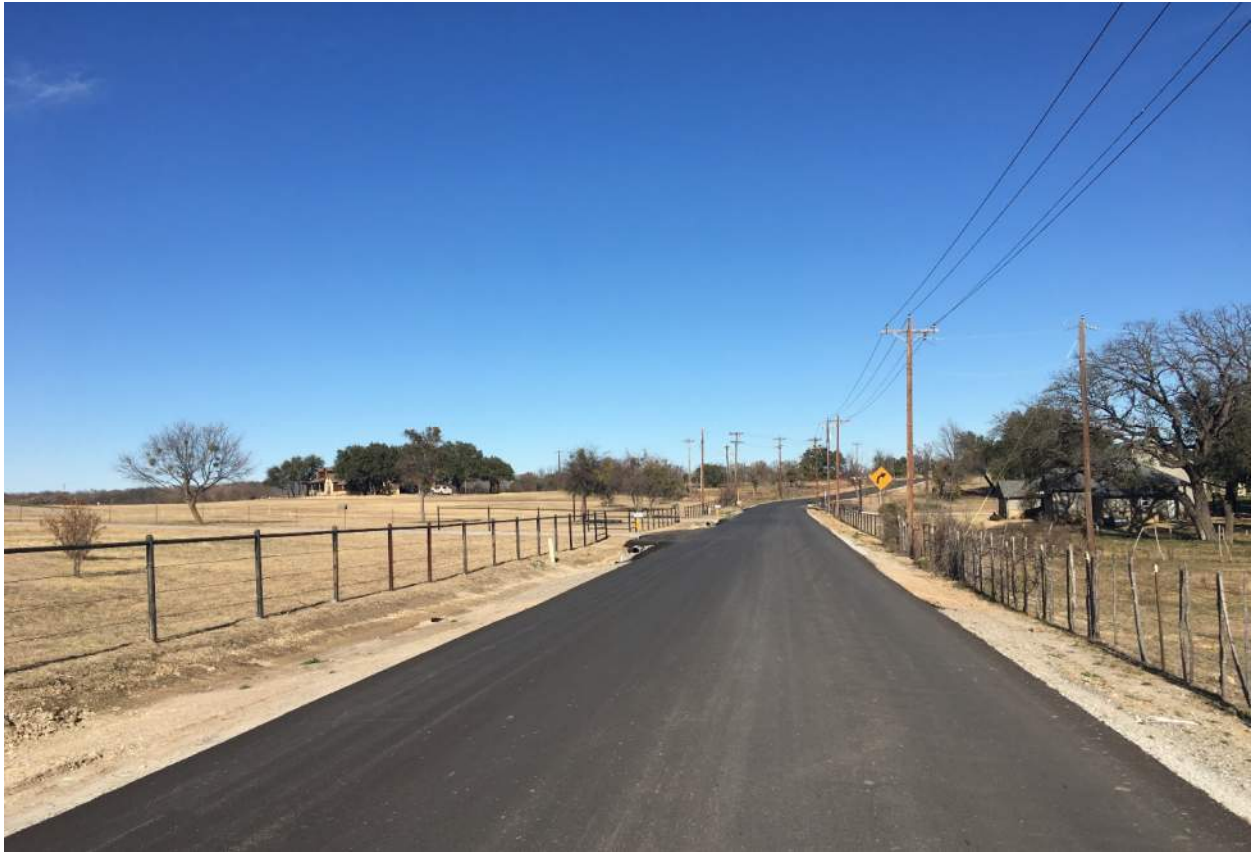
Old Brock Road looking north

Old Brock Road project stretches from FM 1189 to Dennis Road and includes a variety of improvements to include: widening pavement from 20' to 24', bridges improved and widened, curves realigned to improve safety, and right-of-way cleaned/regraded. The County has utilized free base material from TxDOT and hired an asphalt blending company to create the asphalt surface course material. This process saved thousands of dollars and recycled existing materials.