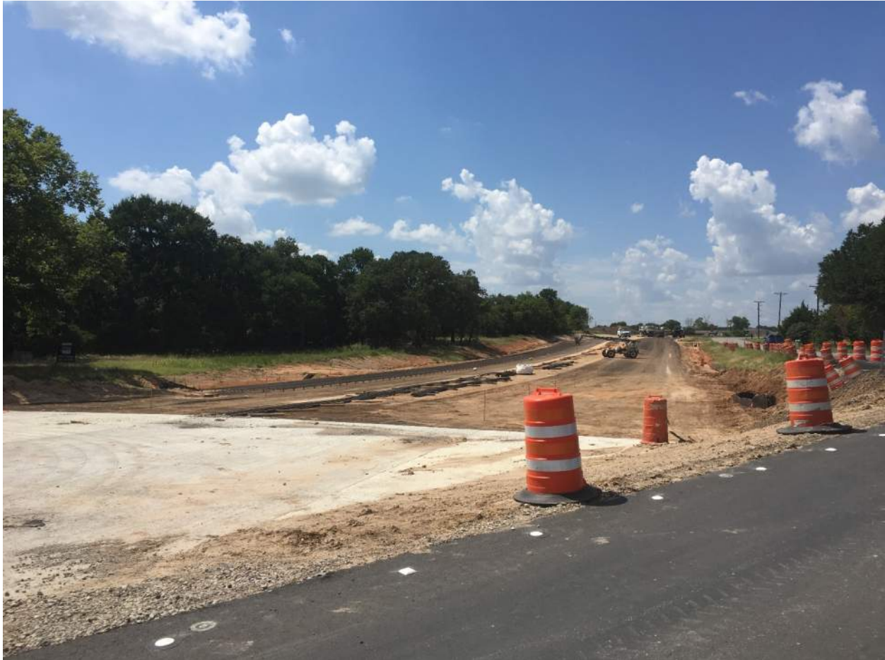
Eastloop Phase 1 – steel placed for tie in at IH-20